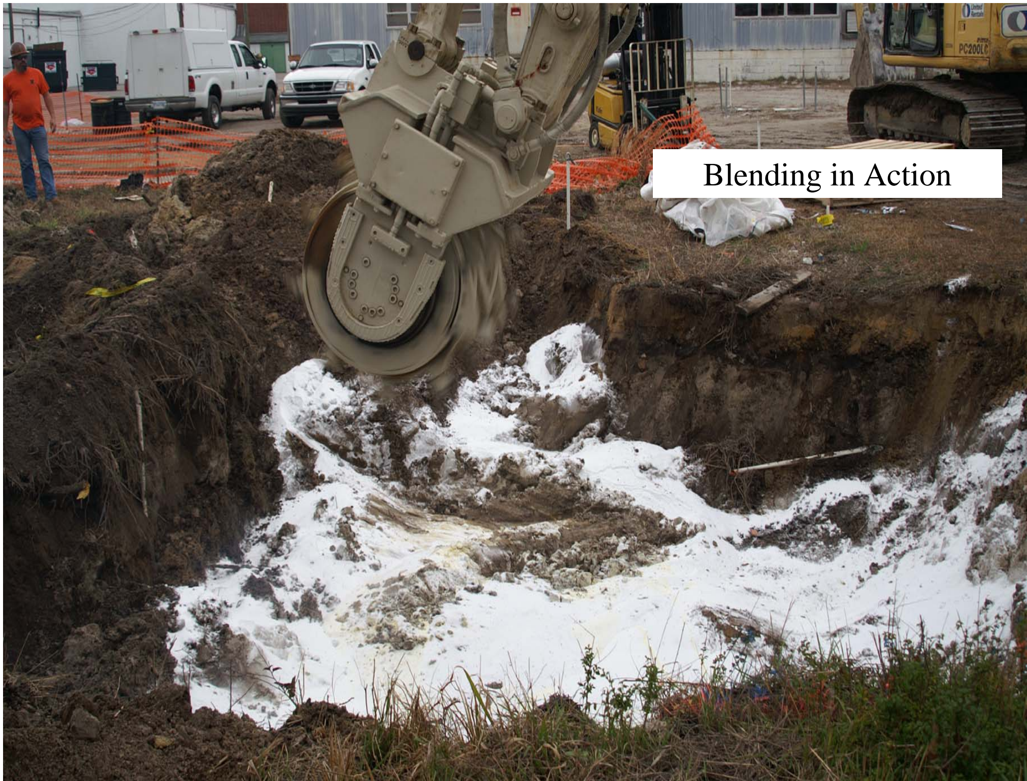
Blending in Action