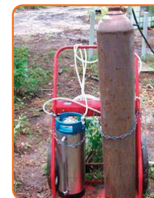
Kegs are shipped on ice in coolers and supplied with 2 quick connects (one for gas and one for liquid) that are fitted with hose barbs for attaching 1/4" ID tubing.

Shaw is the only company that concentrates its bacterial cultures before shipment to your site. The cell concentration process removes >90% of the fermentation by-products that accumulate during the fermentation process. This ensures that injection of SDC-9™ does not create unnecessary water quality issues. It also reduces shipping volume to ensure rapid and cost-effective delivery of SDC-9™ cultures. 180 L of SDC-9™ can be shipped overnight to your site in a single cooler. Overnight shipping allows your cultures to have their greatest activity when they arrive at your site.