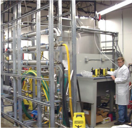
Shaw's 4000-L Fermentor and Cell Concentrator