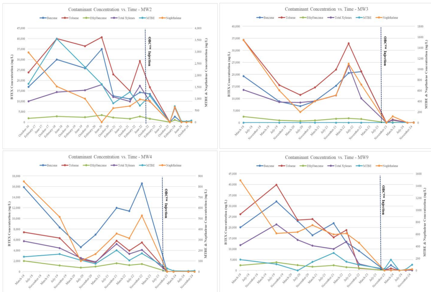
FIGURE 2: Groundwater Concentrations Over Time at MW-2, MW-3, MW-4 and MW-9.